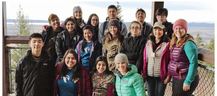
YOUTH LEADERSHIP AMBASSADORS, SKAGIT LAND TRUST WORK PARTY

Youth Leadership Ambassadors is a school-year extension that engages students and alumni from Skagit and Whatcom Counties in outdoor adventures, service work and college preparedness training. In 2017, Ambassadors will meet as a group twice a month — once for an excursion into nearby public lands or to visit local colleges and universities and once for a workshop focusing on college access.