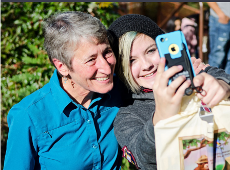
SALLY JEWELL, SECRETARY OF THE INTERIOR

◀ Northwest Youth Leadership Summit North Cascades Institute partnered with The Mountaineers to host more than 100 students for a day of networking and leadership training in Seattle. The